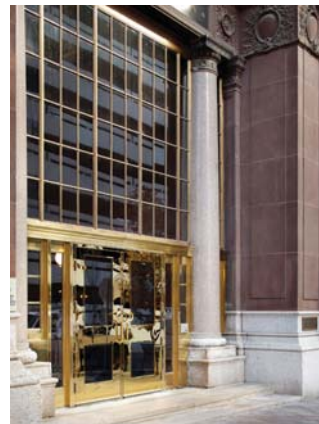
Entrance to New England Insurance - Aquila Energy Corporation