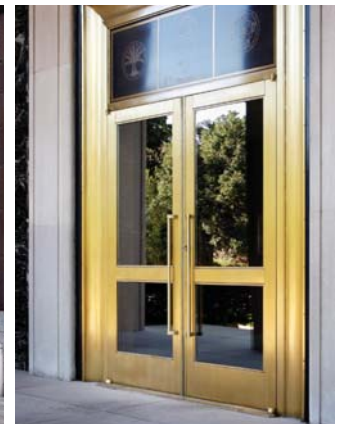
Main Entrance to Linda Hall Library

Bullet Resistant Gold Mirror Stainless Steel