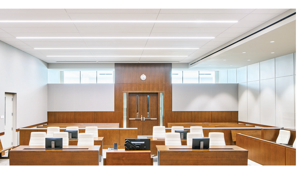
This STC 50-rated door suggests the dignity of the courtroom with its simple design and grain-matched veneer.

Grain continuity for the Johnson County Courthouse was accomplished using blueprint veneer from the wood panel manufacturer. While not a new process for AMBICO, it means extra care has to be taken at all stages of material purchasing, storage, manufacturing, quality control and shipping because no matching replacement veneer is available if a sheet was damaged or incorrectly used.